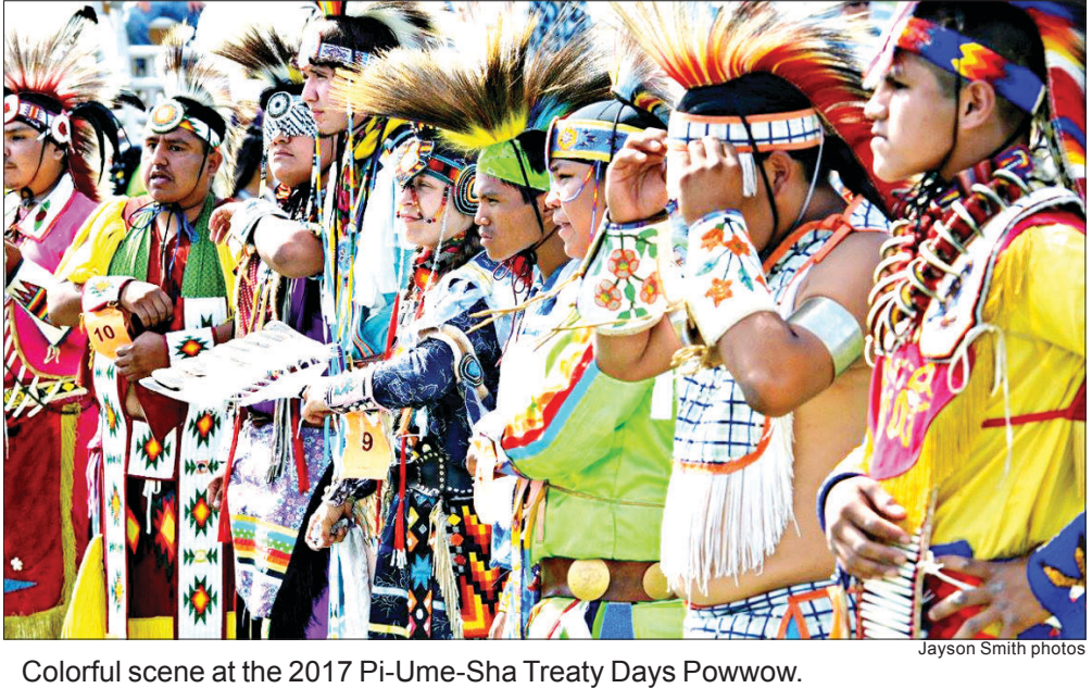
Colorful scene at the 2017 Pi-Ume-Sha Treaty Days Powwow.