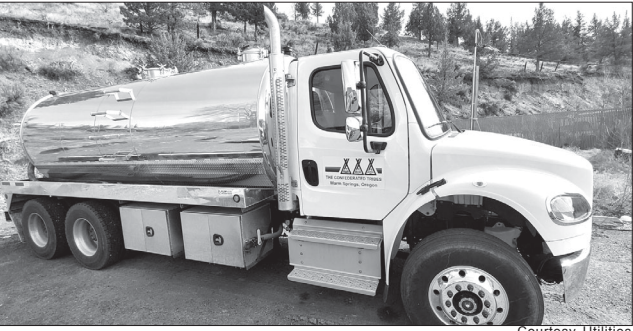
The Warm Springs Utilities septic pump truck.

Homeowners, call 541-553-3246 to schedule an appointment. Payment is